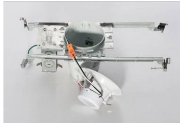
Step2: Insert male connector into female one. Step3: Insert LED trim.