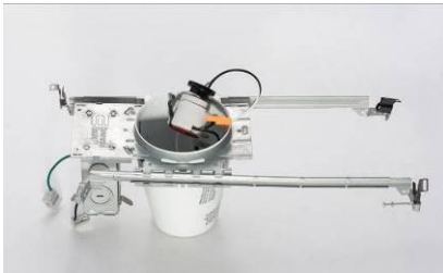
Step1:Twist adaptor into socket.